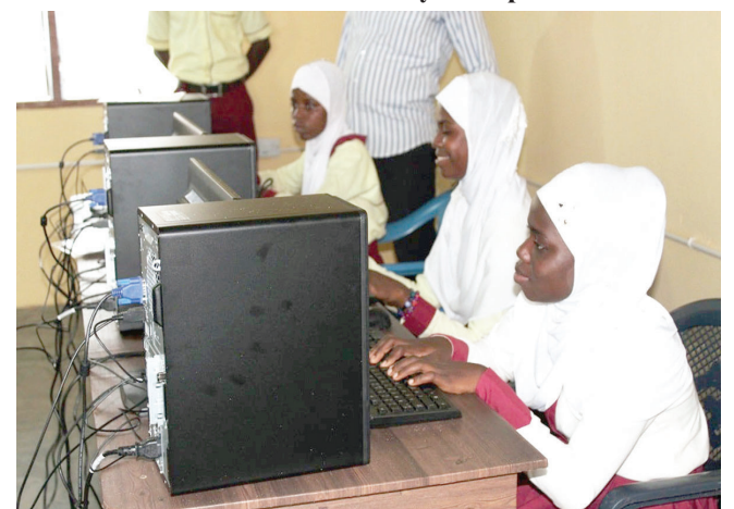
Ann Wilson Computer Lab