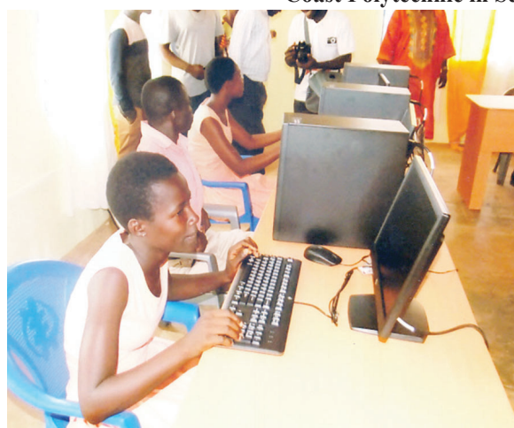
Francia Harvonen Computer Lab