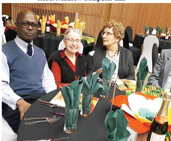
Some of the Board members of AKCLF at Independence celebration