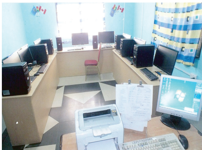
Robert Andrew Computer Lab